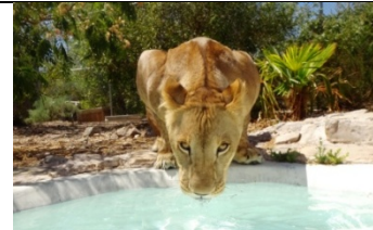
BANNED! Clean water tub to assure the animal welfare