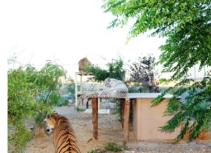
BANNED! Spacious, sturdy & clean exotic cat habitats