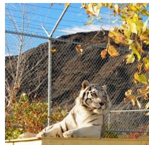
BANNED! Spacious, clean, safe and well maintained strong chain link cages with very happy & healthy residents