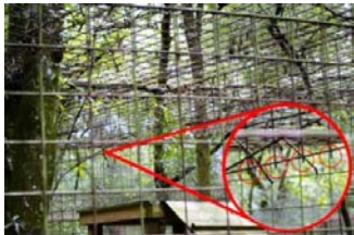
EXEMPT! Rusty or broken wires = public & animal safety risk

This, and similar rural or urban facilities, with clean water and superior, well maintained caging, would be BANNED BY HR 3546 because they don't call themselves a 'sanctuary' and may or might not have 501©3 status. HR3546 is NOT about public safety, conservation, or animal welfare. It is about animal rights, AR, political agenda of removing freedoms from Americans, and creating a special treatment for the exempt entities.