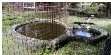
EXEMPT! Dirty green water in the tubs = animal welfare risk